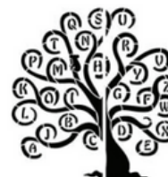
Alphabet tree 2.01m (w) x 2.15m (h)