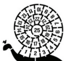
Snail hopstotch 1.79m (w) x 1.7m (h)

Give your playground an active facelift with these stencils. School to provide own spray paint.