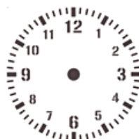
Clock 2.2m (w) x 2.2m (h)