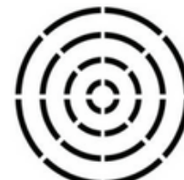
Target 1.8m (w) x 1.8m (h)

To order, please read our terms of hire and complete the form attached.