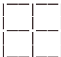
Four squares 4m (w) x 4m (h)