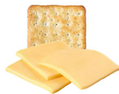
Cheese and wholegrain crackers