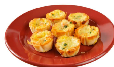
Mini veggie quiche