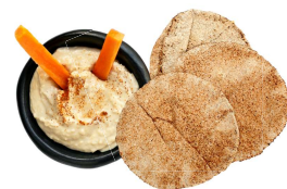
Hummus with veggie sticks or pita bread