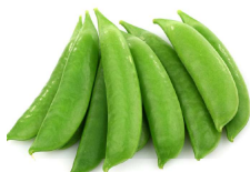
Snap or snow peas