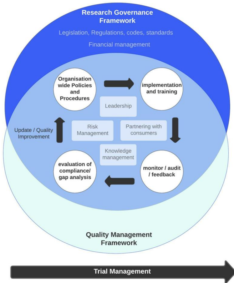
Figure 1. An organisation's Research Governance Framework (RGF) outlines the structure and roles and responsibilities for managing research in an organisation. It is composed of research policies, procedures and training. An effective RGF includes a quality assurance program. At NSW Health Organisations this is delivered through integration with a quality management framework supporting continuous quality improvement, planning and performance, knowledge management, governance, compliance, benchmarking and risk management.